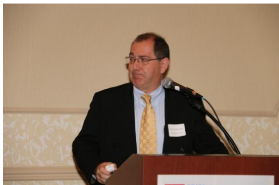
"Advances in Rubber Mixes Using High Performance Fillers"

Thanks to all who attended for supporting the Ohio Rubber Group and a special thank you to the three presenters.