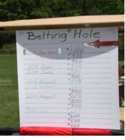
2015 SET A RECORD - $1127!!!